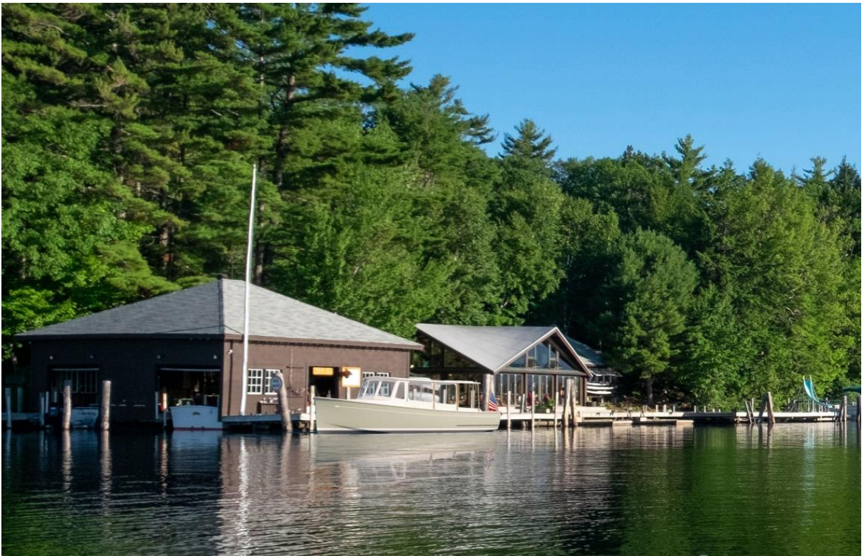
Appy VI specifications – rendering above